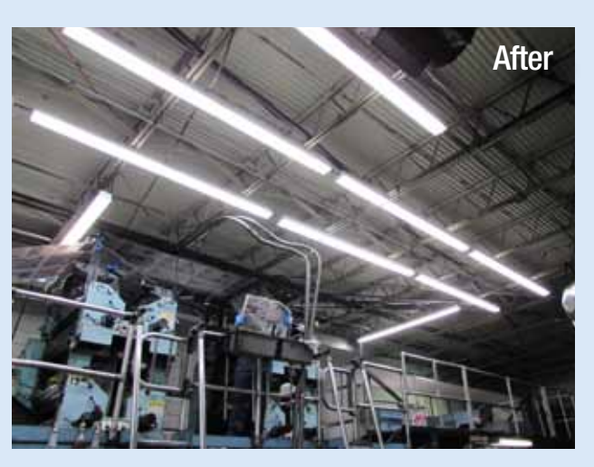
Brighter lighting in the Charlotte Print Center increases employee safety and improves the work environment.